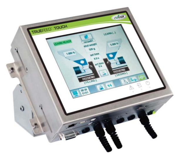
MedLine® TrueFeed Touch Control