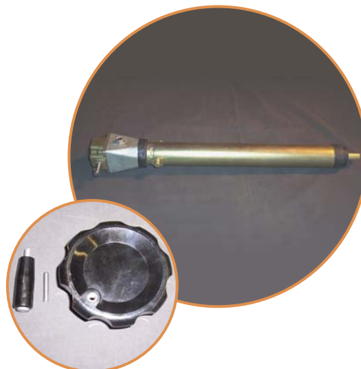
Plastic Handle P10C

Note: The plastic handle is the only item that can be purchased separately.